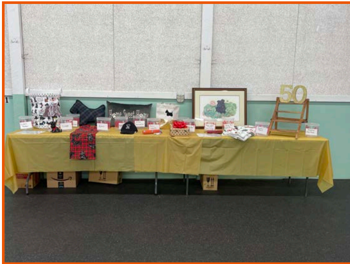
Denise's raffle table.