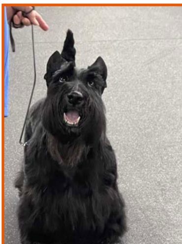
GCHP CH. Woburn Barbary Iron Man