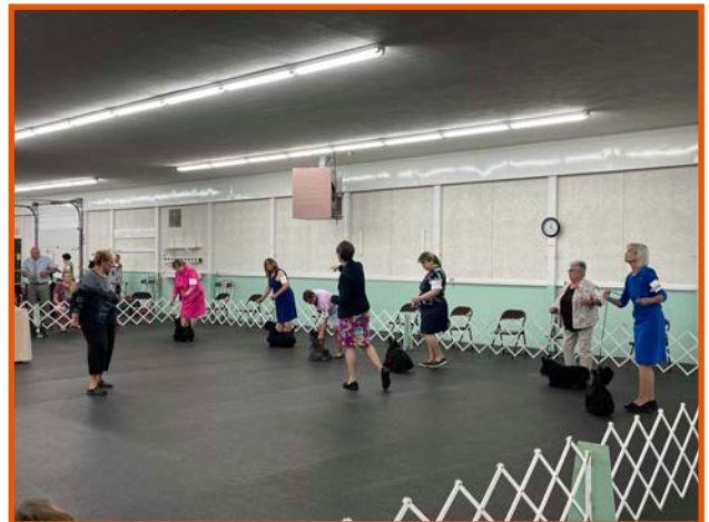
In the ring and ready to show