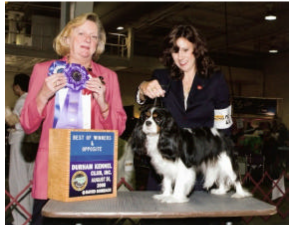
Ch St Jon Jamcroft Myki Likes It - BOW and BOS, Durham Kennel Club