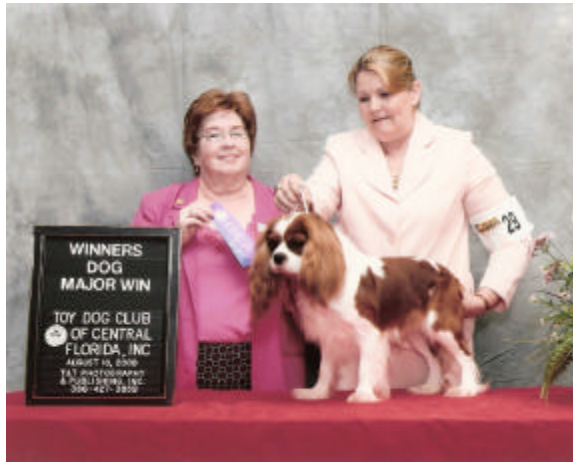
St Jon Ticket To Ride - Winners Dog (major), Toy Dog Club of Central Florida