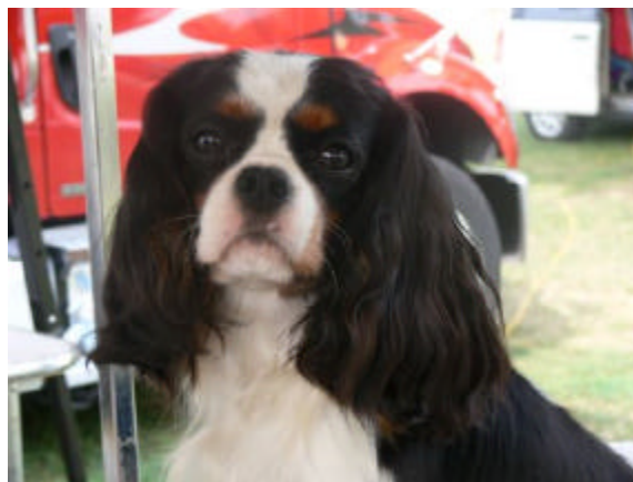
Charterwood Dashing – Winners Dog (major) & BOW Cape Cod Kennel Club