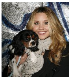
Celebrity Cavaliers! Amanda Bynes loves a tri named Charlie!