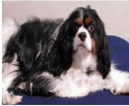
Maggie had severe joint problems in both hips and one knee.