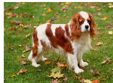
Cavalier King Charles Spaniel

If you would like to view the various point schedules for all the districts & breeds, or just specific districts, please visit the AKC website.