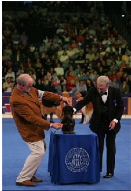
Judging Table