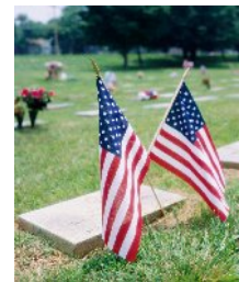
Remembering those whose gave their lives for our country... Memorial Day 2009