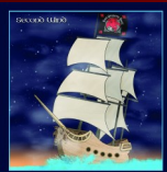
Second Wind (2011)