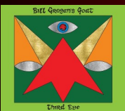
Third Eye (2018)