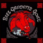
Bill Grogan's Goat (2007)