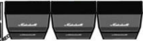
Faux Backline Set Working Amps Behind Faux Backline Guitar Amps