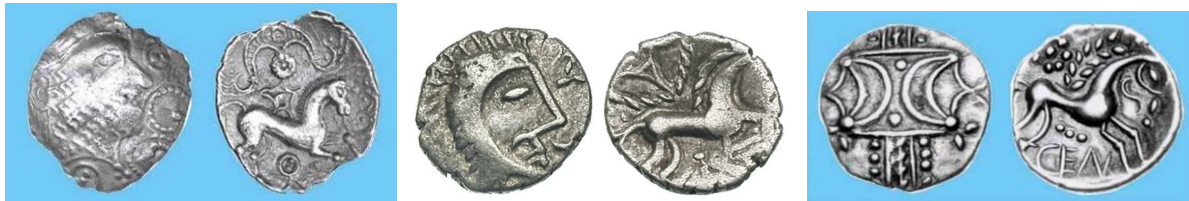
Icenii coins showing the Lusitanian horse.

So now we have two clues that tally, a man whose name points to the same region as the horse on the face of the coins.