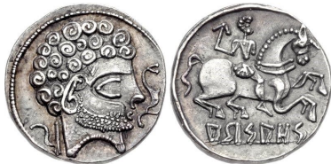
(above) Celtic Iberian coins and (right) a Lusitanian horse with rider.