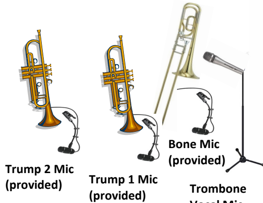
Trump 2 Mic (provided)