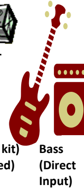
Bass (Direct Input)