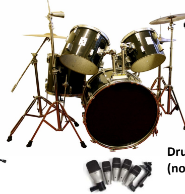
Drums (mic kit) (not provided)