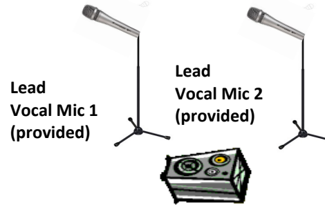
Lead Vocal Mic 1 (provided)